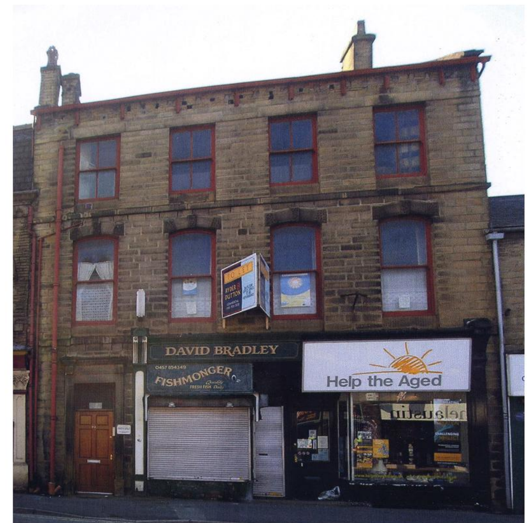
Existing Shop Front