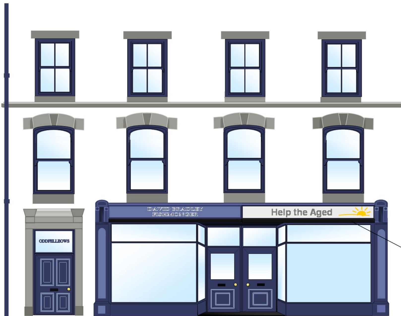
Proposed Shop Front